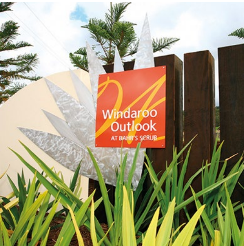
Windaroo Outlook, Bahr's Scrub, Queensland

1980-1989 REGENCY PARK Redcliffe, Queensland | CALLIANDRA VILLAS Mt Gravatt East, Queensland | SPRINGWOOD ESTATE Springwood, Queensland | PANORAMA VISTA Holland Park, Queensland 1990-1999 HERITAGE PARK Strathpine, Queensland | ISLAND QUAYS Gold Coast, Queensland | CANNONVALE HEIGHTS Airlie Beach, Queensland | STRETTON GARDENS Stretton, Queensland | SUNBRIGHT VILLAS Southport, Queensland | SOVEREIGN GARDENS Wishart, Queensland | SINNAMON PARK ESTATE Sinnamon Park, Queensland | SEABRAE APARTMENTS Redcliffe, Queensland | THE AVENUE Sunnybank Hills, Queensland | THE GREENS Rowville, Victoria 2000 ORCHARD HEIGHTS Kuraby, Queensland | SOVEREIGN HEIGHTS Thornlands, Queensland 2002 REGENCY HEIGHTS Eight Mile Plains, Queensland | EDEN RISE ESTATE Berwick, Victoria