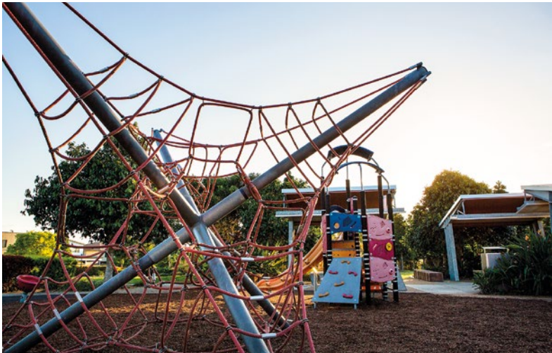
ALL IMAGES ARE INDICATIVE ONLY.

Contact our sales team for more information Ross Cahill 0407 650 621 Sam Chung 0435 126 962 sales@ariserochedale.com.au