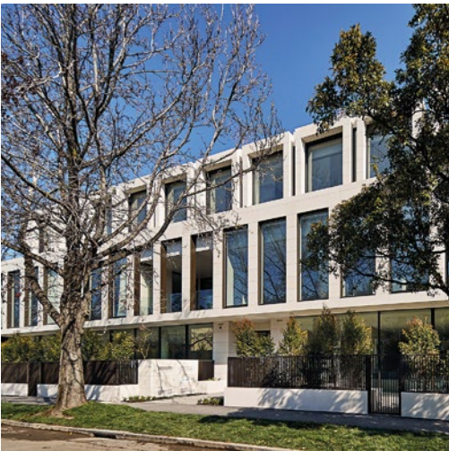
Millswyn, South Yarra, Victoria