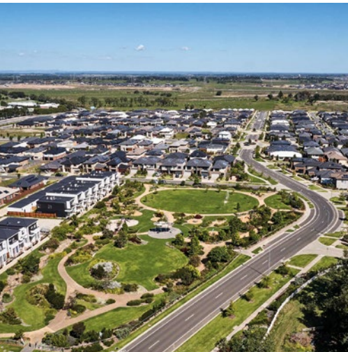
Circa 1886, Clyde North, Victoria

2003 PARADISE SHORES Mackay, Queensland | CHANCELLOR PARK Sippy Downs, Queensland | AXIA APARTMENTS Coorparoo, Queensland | THE SANCTUARY Keysborough, Victoria 2005 MONTRUSE Calamvale, Queensland | EDEN RISE VILLAGE SHOPPING CENTRE Victoria 2006 LEVINGTON Eight Mile Plains, Queensland | AFFINITY Berwick, Victoria | BRUSHWOOD GREEN Forest Lake, Queensland 2007 WINDAROO OUTLOOK Bahr's Scrub, Queensland 2008 PALISADES South Morang, Victoria 2010 PROVIDENCE Greenvale, Victoria | THE RETREAT AT YANDINA Yandina, Queensland 2011 ARISE Rochedale, Queensland 2012 CIRCA 1886 Clyde North, Victoria 2016 MILLSWYN South Yarra, Victoria 2017 HARK Berwick, Victoria 2020 THE MAPLES Greenvale, Victoria | THE PINNACLE Rochedale, Queensland