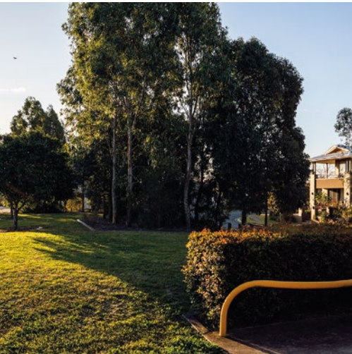
ALL IMAGES ARE INDICATIVE ONLY.