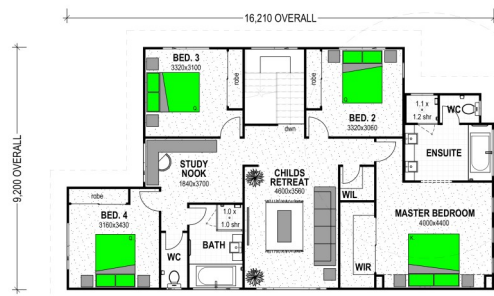
MASTER BEDROOM / ENSUITE OPTION A

Dimensions, photographs, floor plans and façade images are approximate and for illustrative purposes only. This House and Land package is subject to land availability. Photographs may include optional features. Stroud Homes has the right to change plans, specifications, materials and suppliers without notice.