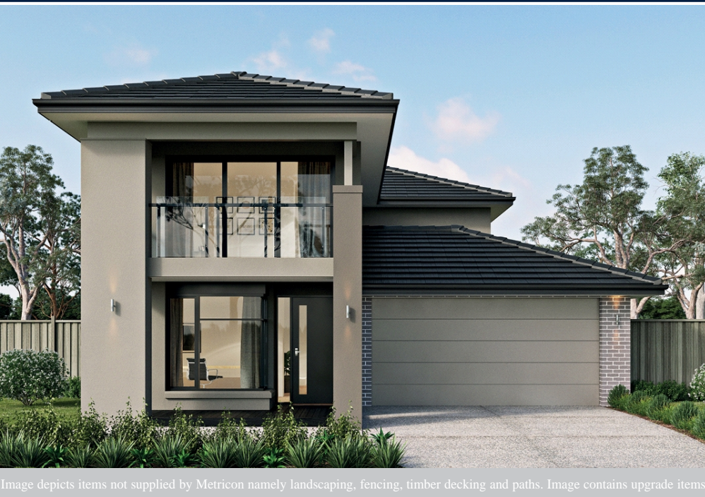
Image depicts items not supplied by Metricon namely landscaping, fencing, timber decking and paths. Image contains upgrade items.